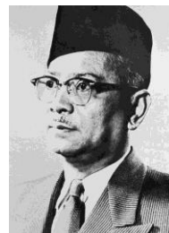
First Malaysian Prime Minister (1957-1970) - Tunku Abdul Rahman

Our forefathers who had migrated to Malaya, at the beginning of the 20th Century, played a major role in the development of the country. They faced numerous challenges such as diseases and the Japanese Occupation and we are proud of their achievements. Let's join together to celebrate our independence from British rule regardless of our ethnicity, culture, religion, social standing, or any other many differences..