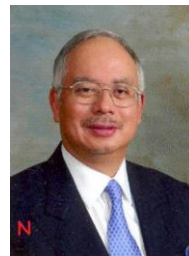
Sixth Malaysian Prime Minister (2009 – Present) - Datuk Seri Najib Tun Razak